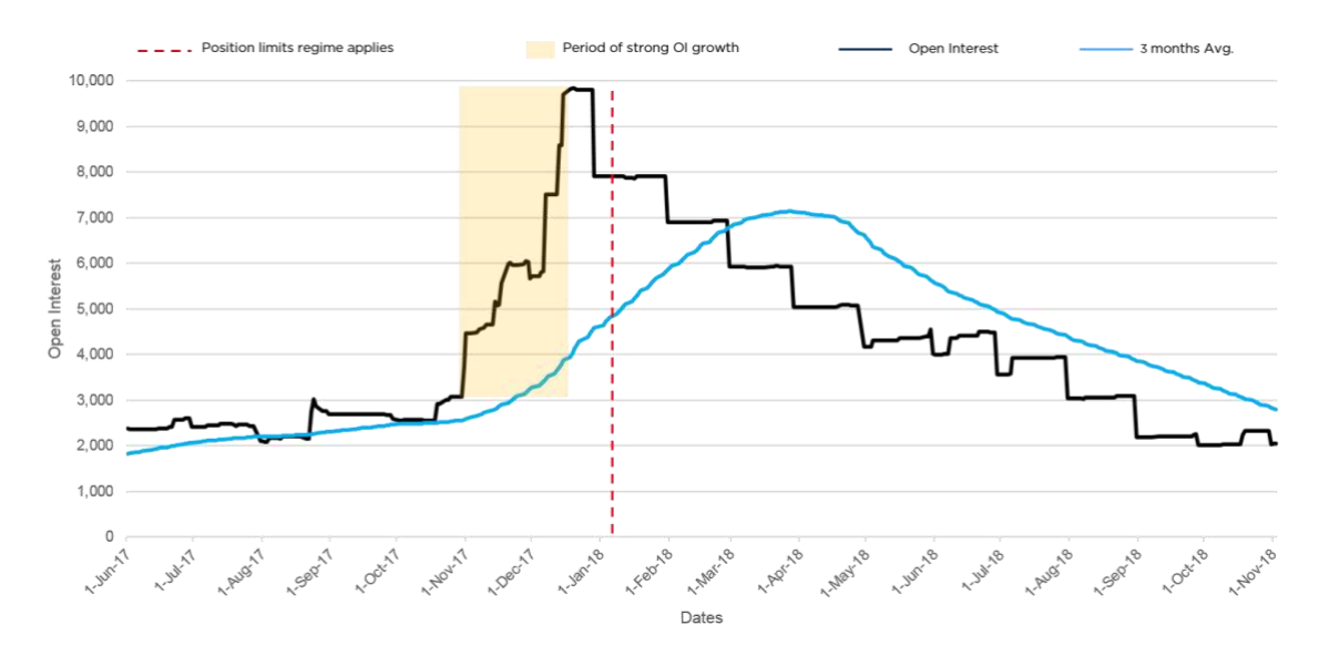
Figure 1: Impact of position limit regime on development of ICE Endex Italian PSV Gas Futures market.

In practice it has proven to be impossible for NCAs to reclassify markets and recalibrate the applicable limits quickly enough and in a manner that would prevent a negative impact on the development of fast growing markets. Figure 1 illustrates this negative impact on one of ICE's previously fast growing markets when subjected to the MiFID II position limit regime. The material growth in open interest (area marked in yellow) started in Q4 2017, but this momentum was severely impaired at the end of 2017 and in early 2018 in anticipation of the introduction of the MiFID II position limit regime. Before any reclassification of this market and subsequent recalibration of the limit could occur, the damage caused to the development of this market had proven to be irrevocable. This negative effect on the development of commodity derivatives markets described above is stereotypical for fast growing markets subject to the MiFID II position limit regime.